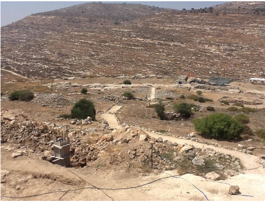
Hills of Ephraim around Shiloh