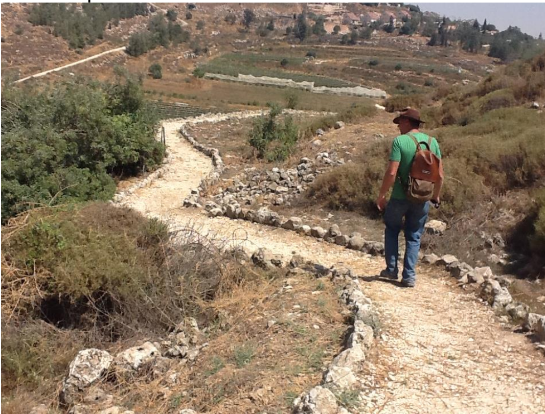
Galyn takes a trail to the excavation site of 1100 BC Shiloh