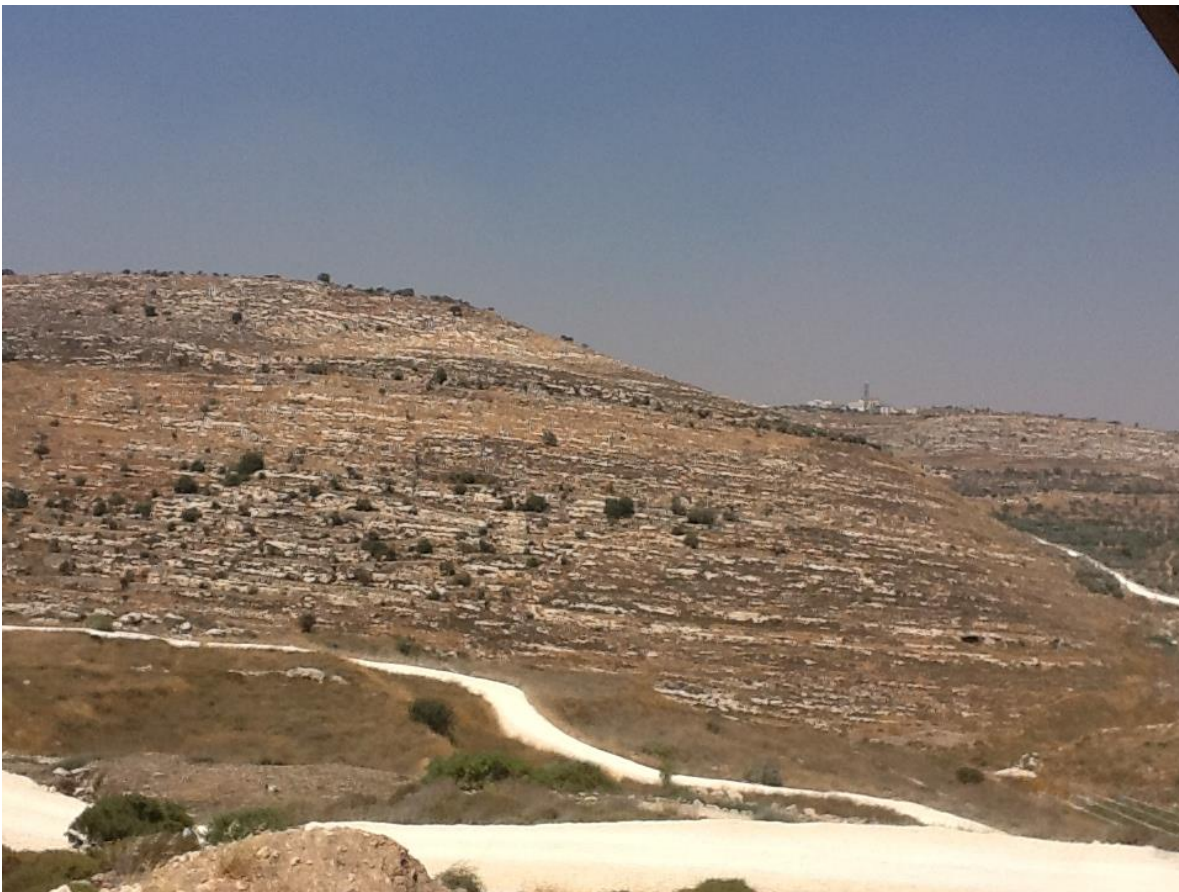
Ephraim Hill Country as seen from the windy hill of Shiloh