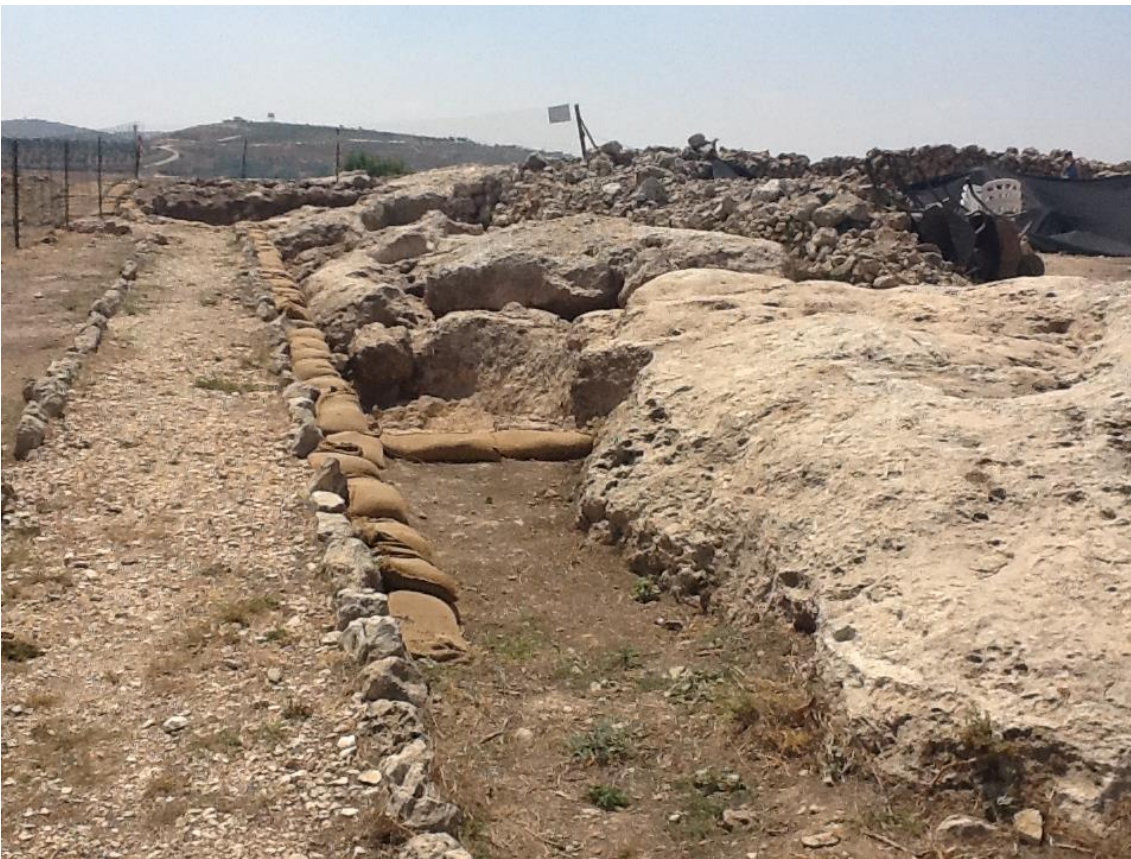
Very near the location of the Tabernacle