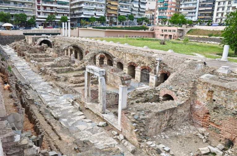
Forum or Agora of Thessalonica