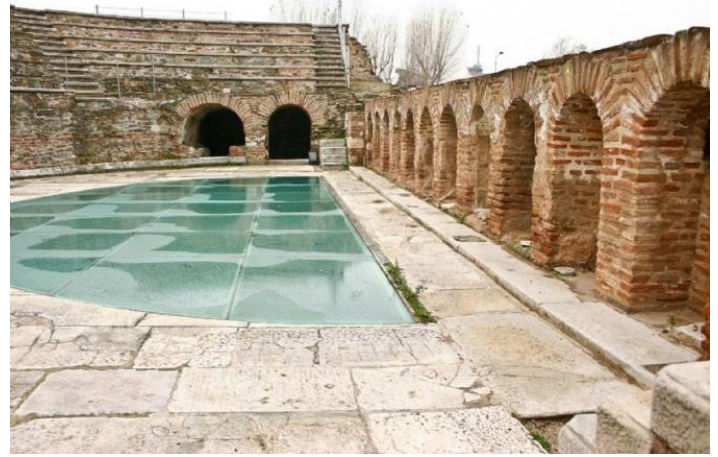
Odeum or Theater located east of the forum.