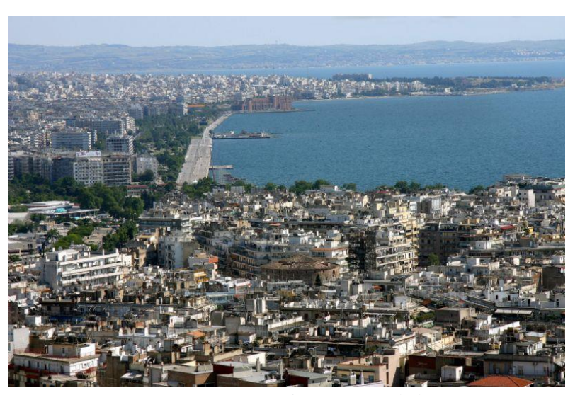
Modern Bay of Thessaloniki

17:10 – Leave the Via Egnatia (which continued west) Paul is taken 47 miles southwest to Berea which was on the road to Athens.