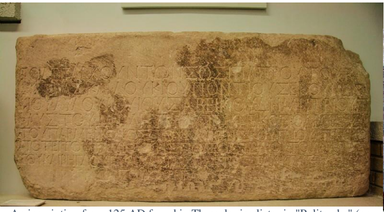
An inscription from 125 AD found in Thessalonica lists six "Politarchs" (or, "Rulers of the Citizens"). This term "politarch" is used by Luke in Acts 17:6 and 8 to refer to officials in Thessalonica. Before the discovery of this inscription critics claimed the writer of Acts was making up information and had many false claims and incorrect statements. This along with other discoveries has validated the authenticity of the Book of Acts, and at the same time, has refuted the critics as ignorant and anti-scripture.