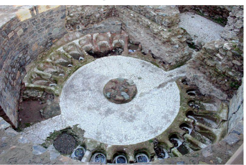
24 bathtubs at the southeast end of the Forum. Each tub has an upper and lower level.